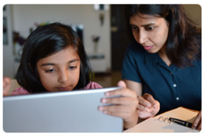
Back to School During COVID-19: Resources for Learning, Health and Well Being